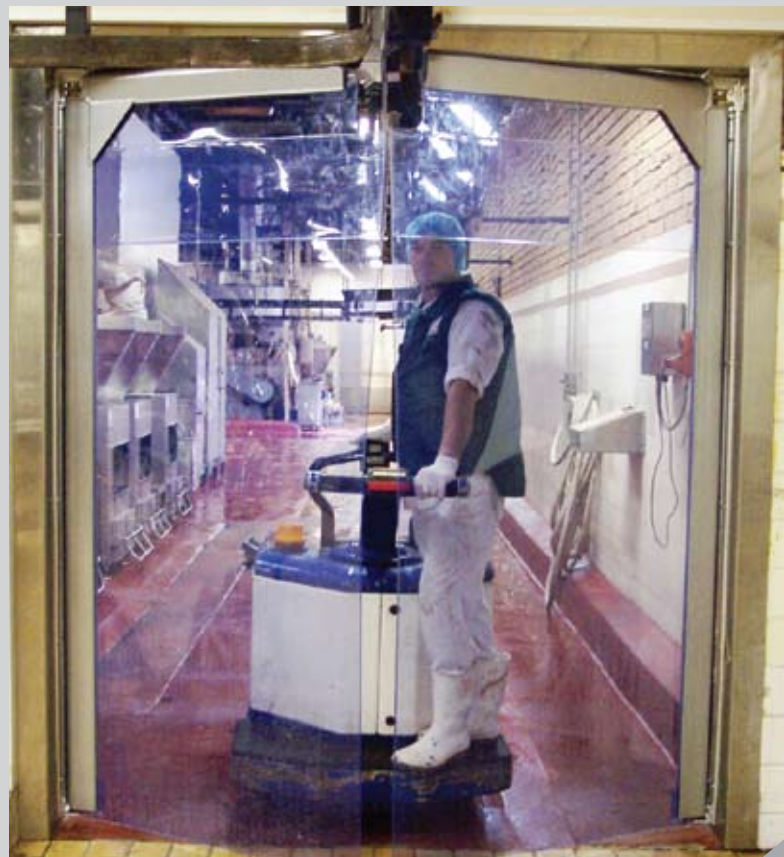
PVC swing door allows convenient access or personnel, trolleys and conveyancing equipment