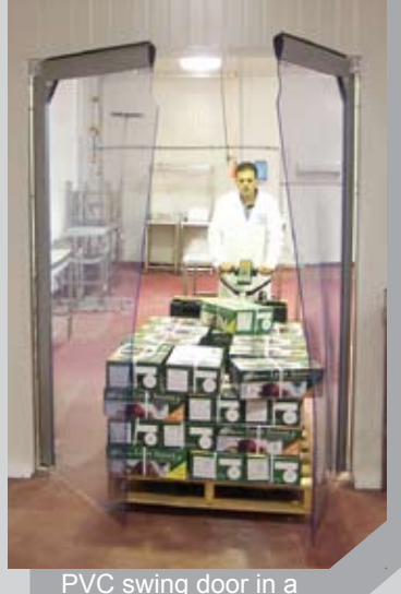
PVC swing door in a food processing facility